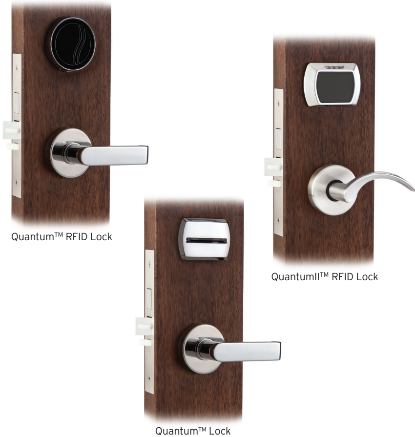
Quantum™ RFID Lock