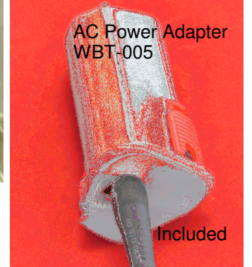
AC Power Adapter WBT-005