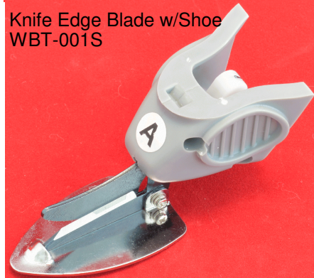
Knife Edge Blade w/Shoe WBT-001S