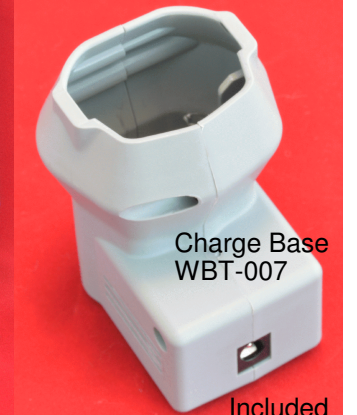
Charge Base WBT-007