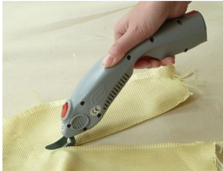
Shown here cutting aramid mat using the Knife Edge Blade

Complete kit includes 2 blade assemblies, battery, AC adapter & charger