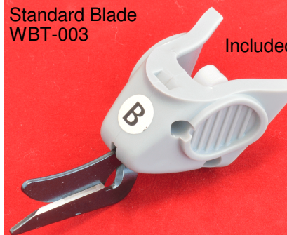
Standard Blade WBT-003