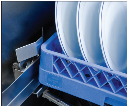
RackAware™ Automatic Rack Sensing System* only runs a cycle when a rack is present