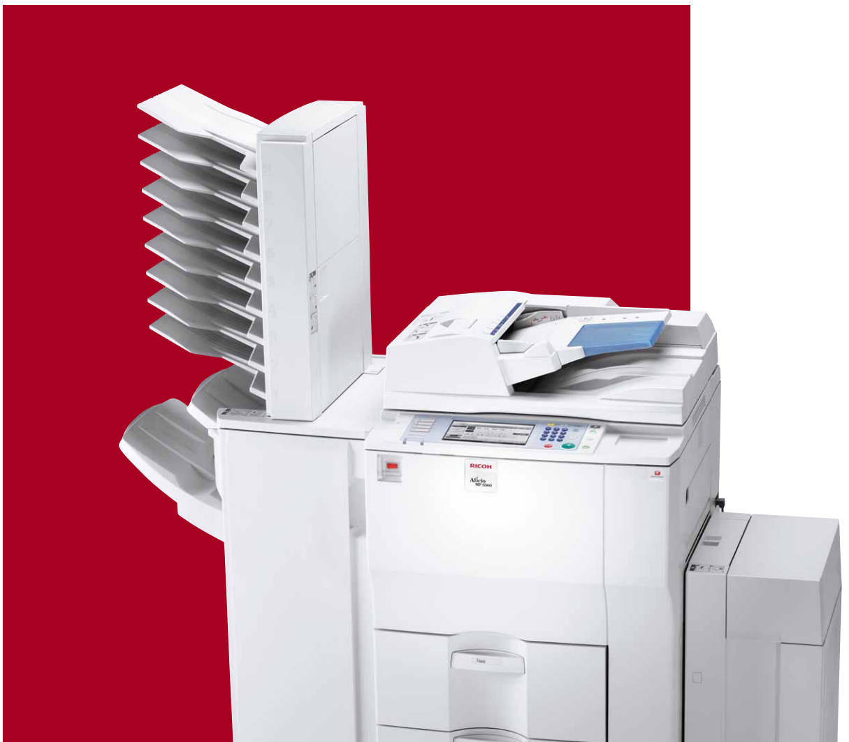
Aficio™ MP 5500/MP 6500